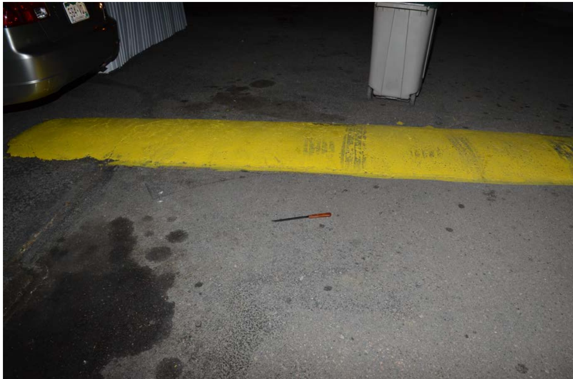
Knife wielded by Castaway