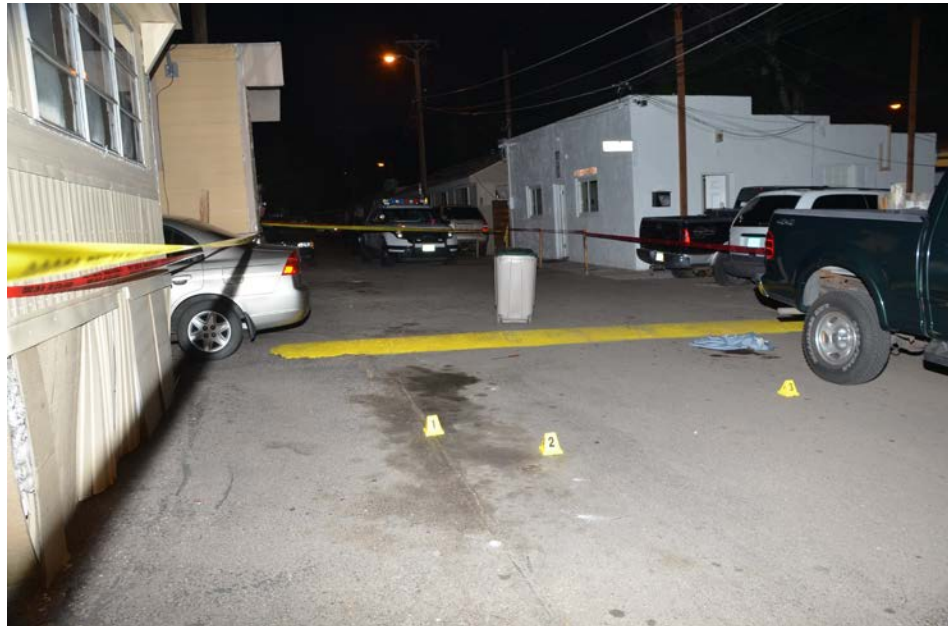
Area where shooting took place – Trash can and “speed bump” encountered by Officer Traudt as he backed up are shown. Markers 1, 2, and 3 are placed next to spent shell casings.