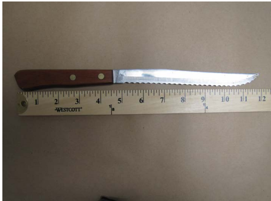
Castaway's knife – overall length of one foot