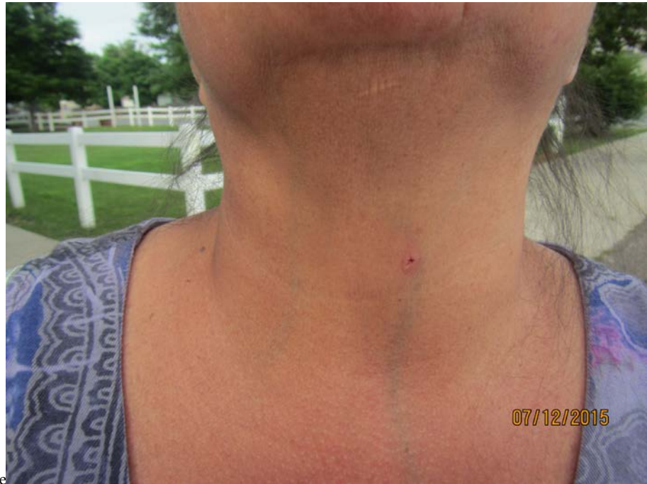
Close-up of puncture wound to Ms. Castaway's neck.