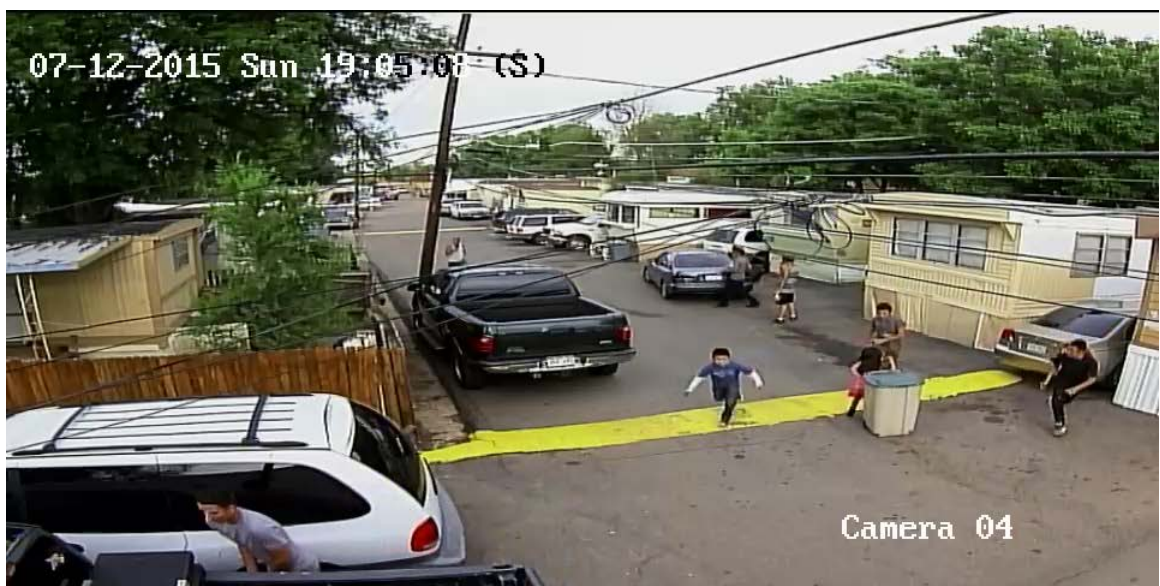
Still photo from surveillance video - Castaway is seen in the middle of the frame. At the lower left, a young girl is pulling the trash-receptacle. Several children are starting to run away from the area.