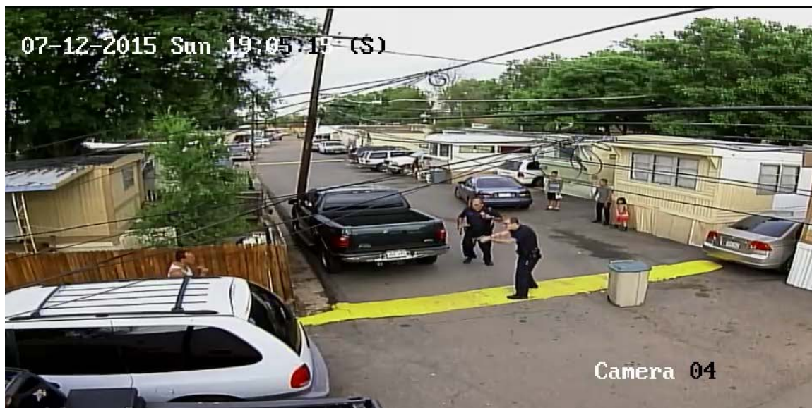
Still photo from surveillance video - Castaway is shown facing the officers, holding the knife to his neck. Officer Traudt is standing on the speed bump several feet in front of the trash receptacle. Officer Lara is standing next to the pick-up truck.