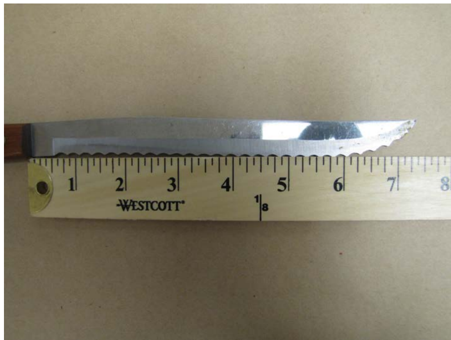
Castaway's knife – blade length of 7.5 inches.