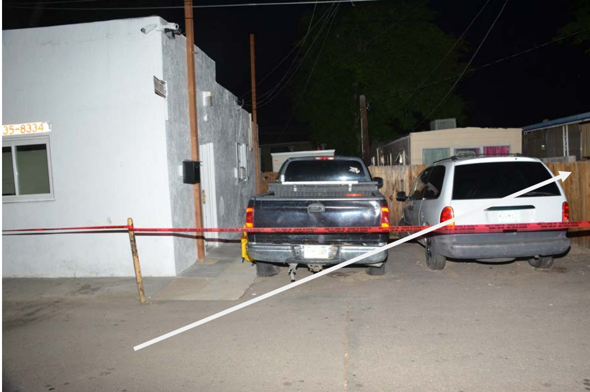
Fence lane into which Castaway fled and from which he returned and began approaching the pursuing officers.