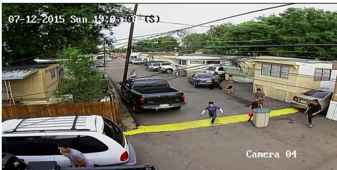
Still photo from surveillance video - Castaway is seen in the middle of the frame. At the lower left, a young girl is pulling the trash-receptacle. Several children are starting to run away from the area.